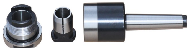
Nose End Collet Chuck Body

Each set is supplied in a fitted case, complete with 4 collets and an assembly spanner